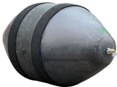
Cone pipe stoppers ULK

Attention: Please read these instructions carefully before use!