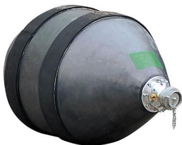
Cone test pipe stoppers PULK